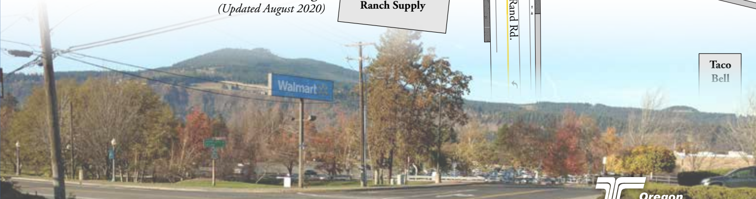
Photo: Existing U.S. 30/Rand Road Intersection